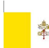
Apostolic Nunciature to United States