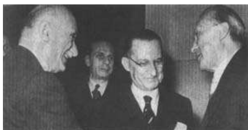
ALCIDE DE GASPERI

"In the long term the future of the West is not so much threatened by a political tension as from the danger of standardization, uniformity of thought and feeling; in short, from all over the life system, the escape from responsibility, with the only self-concern. This risk can really become fatal for the cultural progress"(Konrad Adenauer)