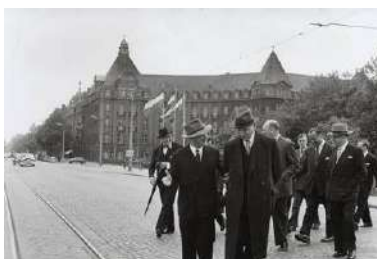
WITH JEAN MONNET

"Europe will not be made all at once, or according to a single plan. It will be built through concrete achievements which first create a de facto solidarity."