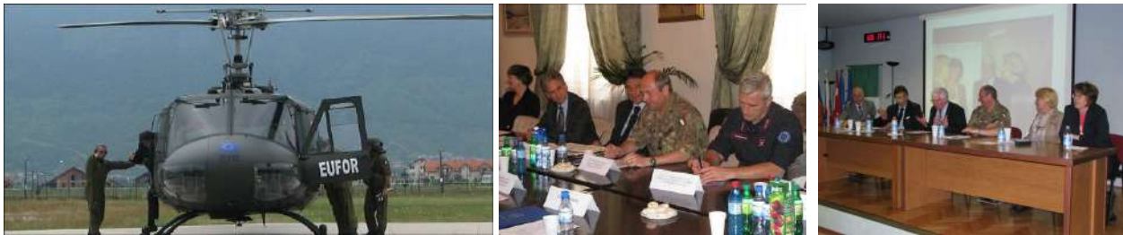
SARAJEVO - HQ EUFOR - RECTORATE UNIVERSITY Commander EURFOR with President AESI (left) With Rectors of Universities of Sarajevo and Belgrade (right)

If one of the basic challenges of the 21st Century is, undoubtedly, international peace and security in the light of the new world balance, there are problems today can only solved by collective action at global level: there is a new thinking on the way to approach global issues for a “global public goods”. New problems, new perceptions with specific solutions. This approaching strategy is a matter of culture as it is made not only of perfect knowledge of the theoretical elements of crisis management of humanitarian crises, but also of the capability to understanding the real comprehensive needs of these populations, theirs historical and cultural roots in order to give efficient answers, promoting the development even the first phases of the aid. For this reason, the international community must propose itself as a protagonist of a new strategy to intervene in crisis areas, a strategy based on a real and adequate foreign policy and on a common security policy. Such strategy must represent not only the expression of diplomatic, economic and military action, but also be able to set its roots in the common goal of development a strong humanitarian culture of solidarity capable of understanding providing quick and efficient answers in human and professional terms.