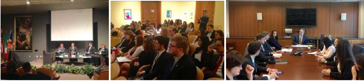
WASHINGTON DC. ITALIAN EMBASSY -FORUM AESI with American Universities (left) US DEPARTMENT OF STATE – Meeting with Diplomat Desk Italy and Holy See (right)

This is also the urgent reason why it is essential to think over the role of university, which in addition to devoting itself to education and research, has to be able to educate for peace and civil cohabitation. In this regard, we don't need only well-trained experts with the capability of working out fast and efficient interventions, but we need also of people with this capability of understanding the different human situations offering to the needing populations efficient and rapid answers. All of this requires real new role of university, which it is not only thought of a place where people can exchange ideas and deepen culture, but also and above all as an institution actively engaged in serving society. Interdependence, international co-operation, solidarity and collaboration between different institutions, International Organisations and Academic World are key-concepts to be practised in order to be able to prevent and to face these emergency and humanitarian crises, to carry out rapid and efficient programmes. The global society , which we are often speaking about, will not exist until we will get used to referring to these concept of global responsibility in our everyday lives.