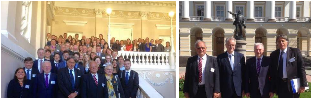
ST. PETERSBURG AESI FORUM with Rectors of State Economic and Vienna Universities (left) With Rectors and Minister of Foreign Affairs of St. Petersburg Government (Russian Federation) (right)

This is also the urgent reason why it is essential to think over the role of university, which in addition to devoting itself to education and research, has to be able to educate for peace and civil cohabitation. In this regard, we don't need only well-trained experts with the capability of working out fast and efficient interventions, but we need also of people with this capability of understanding the different human situations offering to the needing populations efficient and rapid answers. All of this requires real new role of university, which it is not only thought of a place where people can exchange ideas and deepen culture, but also and above all as an institution actively engaged in serving society. Interdependence, international co-operation, solidarity and collaboration between different institutions, International Organisations and Academic World are key-concepts to be practised in order to be able to prevent and to face these emergency and humanitarian crises, to carry out rapid and efficient programmes. The global society , which we are often speaking about, will not exist until we will get used to referring to these concept of global responsibility in our everyday lives.